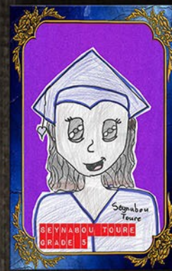
SEYNABOU TOURE GRADE 3