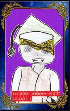
AMIERE BROWN-WITTY GRADE 3