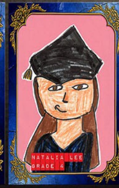
NATALIA LEE GRADE 4