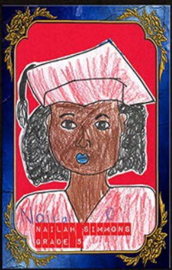
NAILAH SIMMONS GRADE 3