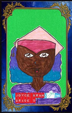
JOYCE KRAH GRADE 5