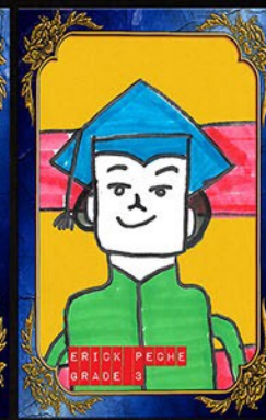
ERICK PECHE GRADE 3