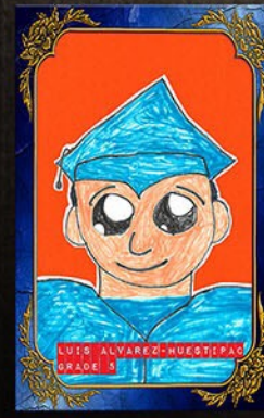
LUIS ALVAREZ-NUESTIPAC GRADE 5