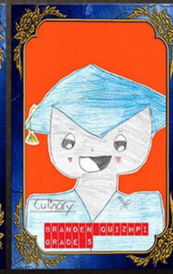
BRANDON QUIJIPE GRADE 5