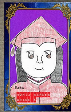
MONIA BARNES GRADE 3