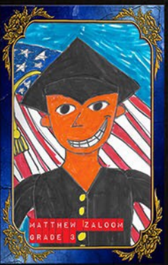
MATTHEW ZALOOCH GRADE 3